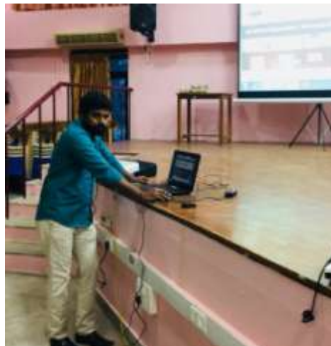
Fig. 20. Technical Support