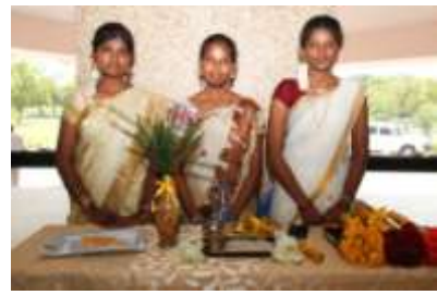
Fig. 19. The Reception Team