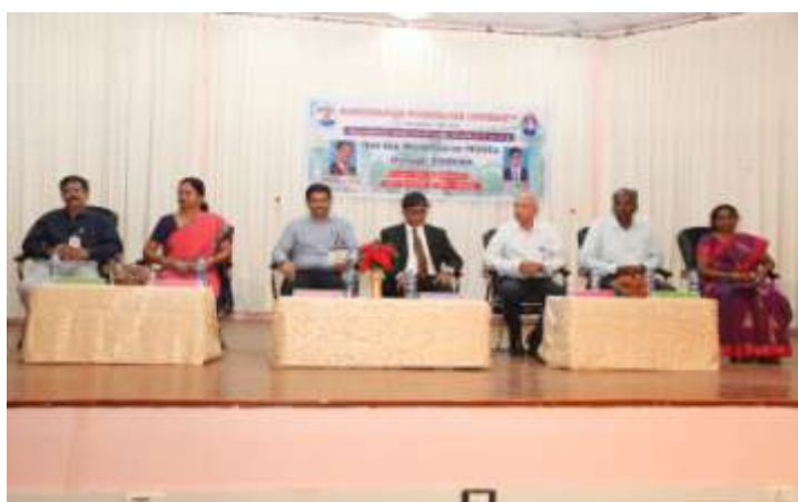
Fig. 1 Workshop on MOOCs through SWAYAM