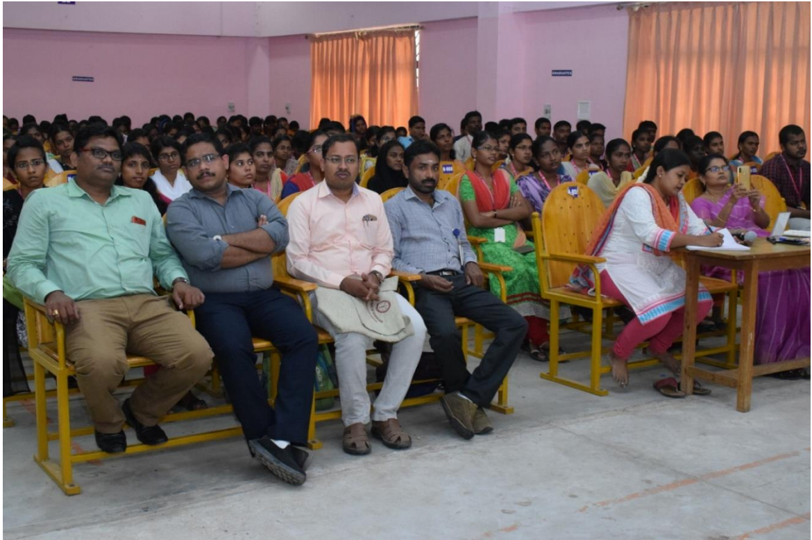
Participants – Mentors and Mentees