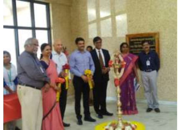
Fig.5. VIP Reception