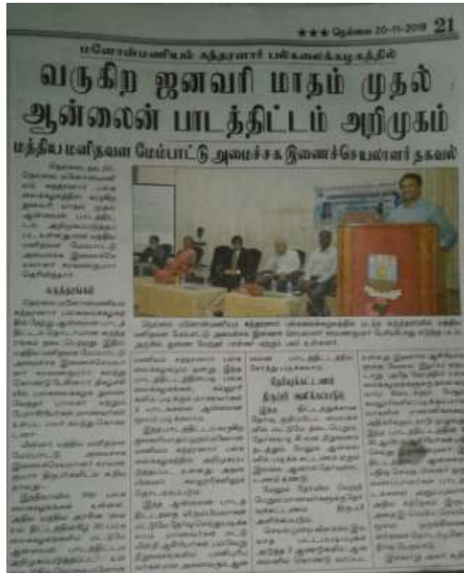
Fig. 3. Press release on the one day workshop on MOOCs through SWAYAM held on 19.11.2018, dated 20.11.2018