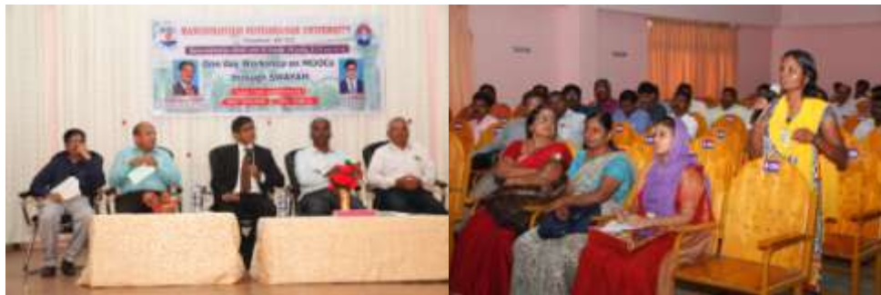
Fig. 17. The Interaction Session