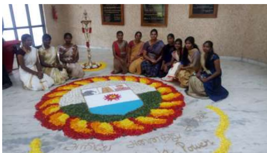
Fig. 4. Entrance hall of the Auditorium