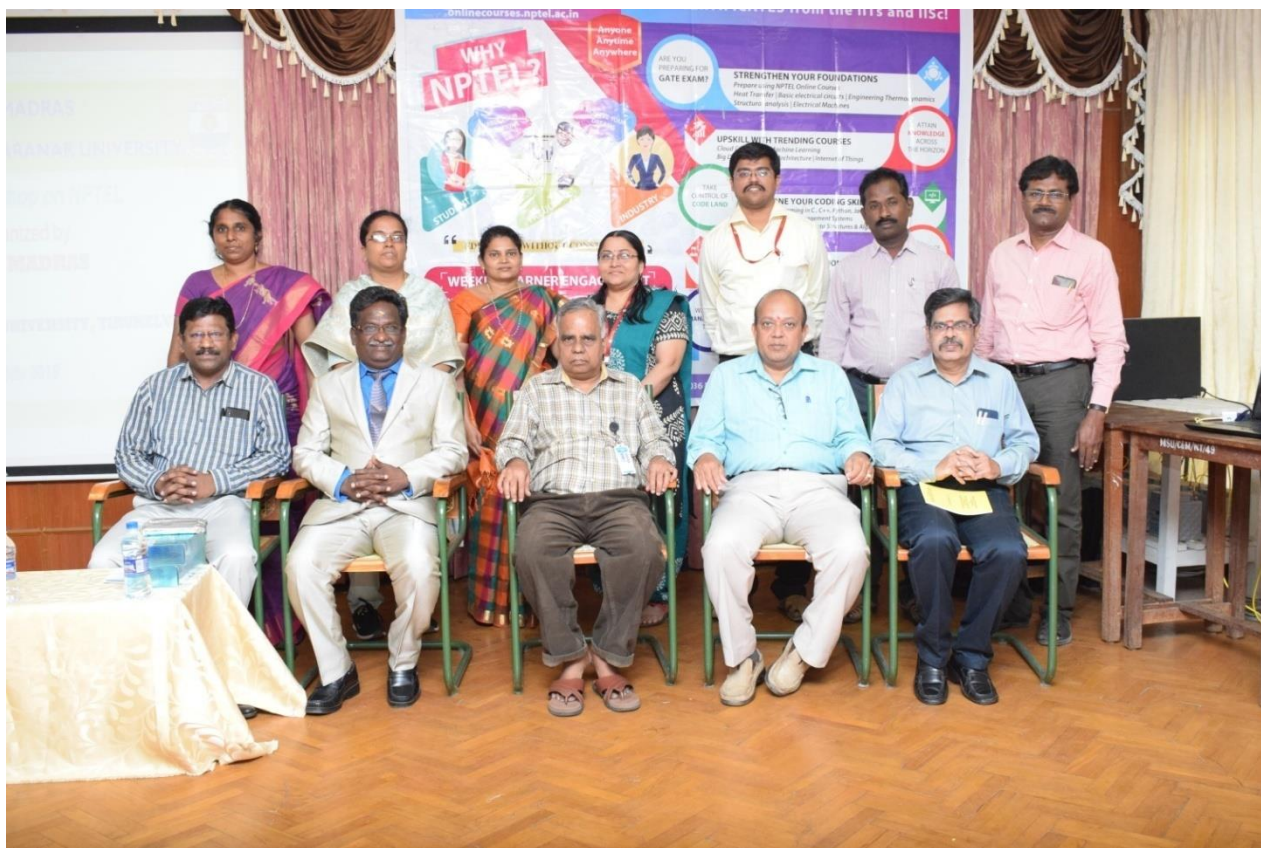
NPTEL Team with Authorities of the University