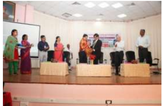
Fig.10. The Vice-Chancellor honors the Chief Guest