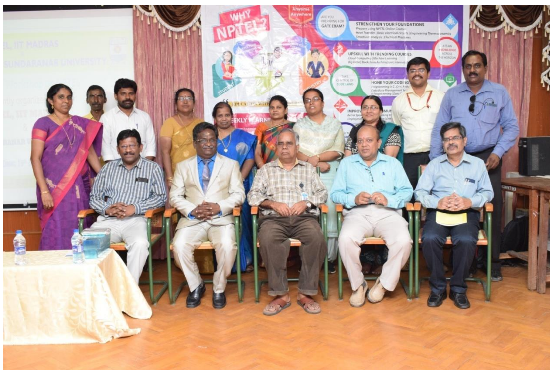
NPTEL Team and the Authorities of the University with the Administrative Staff