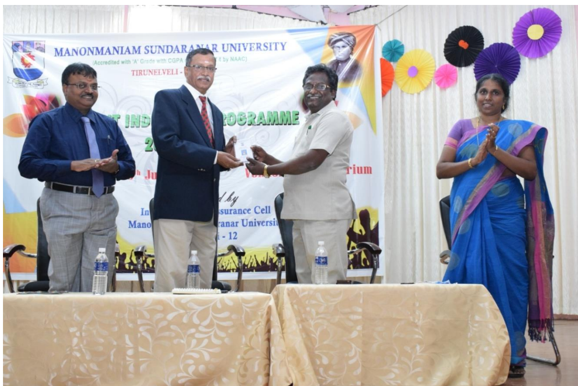
Memento to the Controller of Examinations