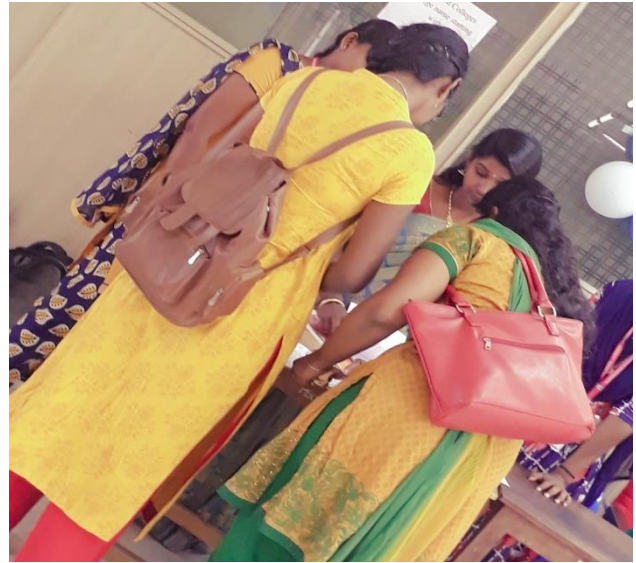
Scholars at work