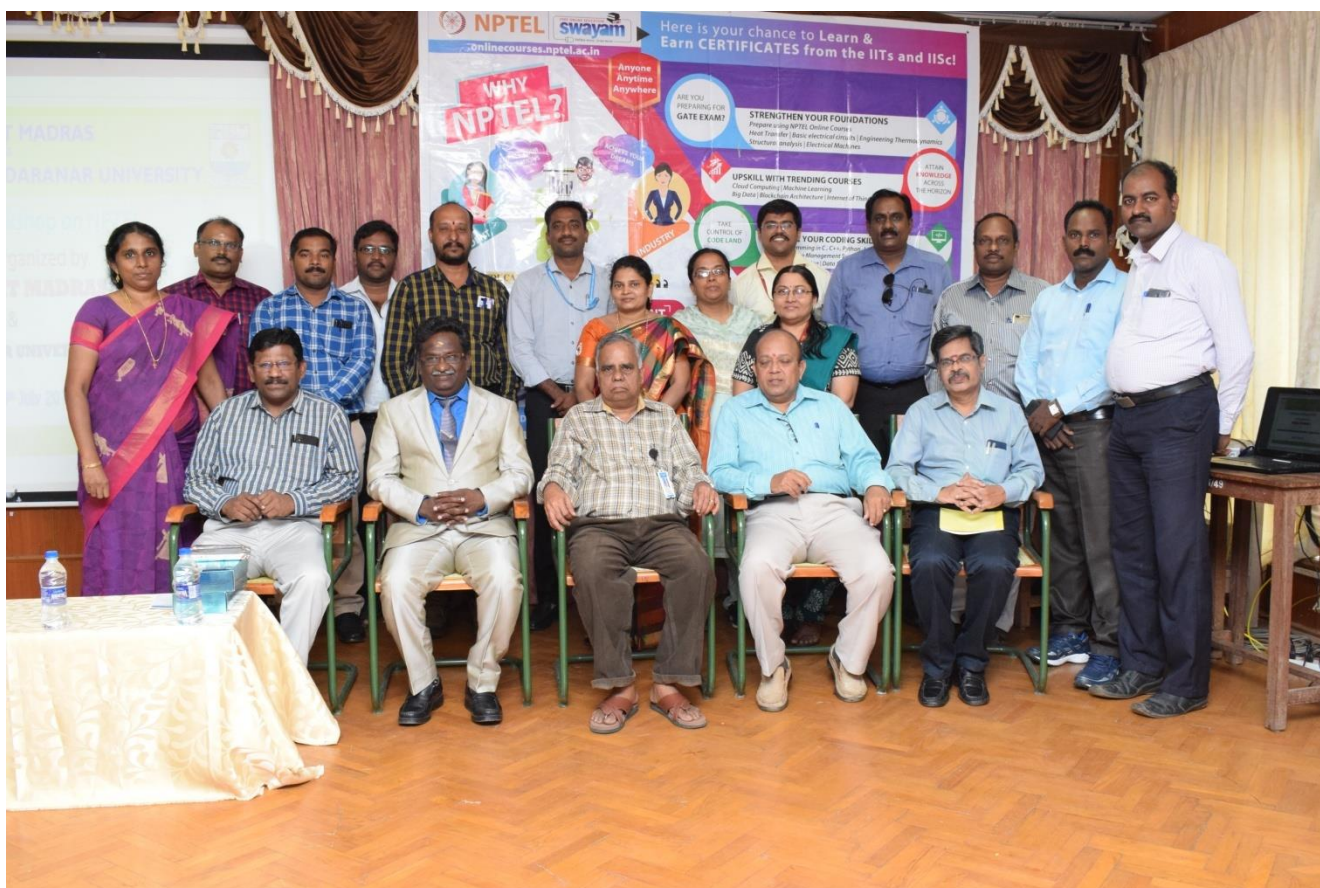
NPTEL Team and the Authorities of the University with the subset of the dynamic and goal-oriented mentor team

[ Note: 20 of the mentors appeared for Exam last semester and got successful NPTEL Certification (100% success), thus they prove, “the leaders - the role models”]