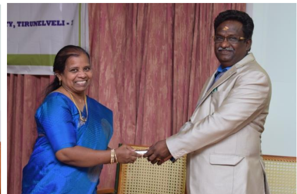
Honouring the University Authorities