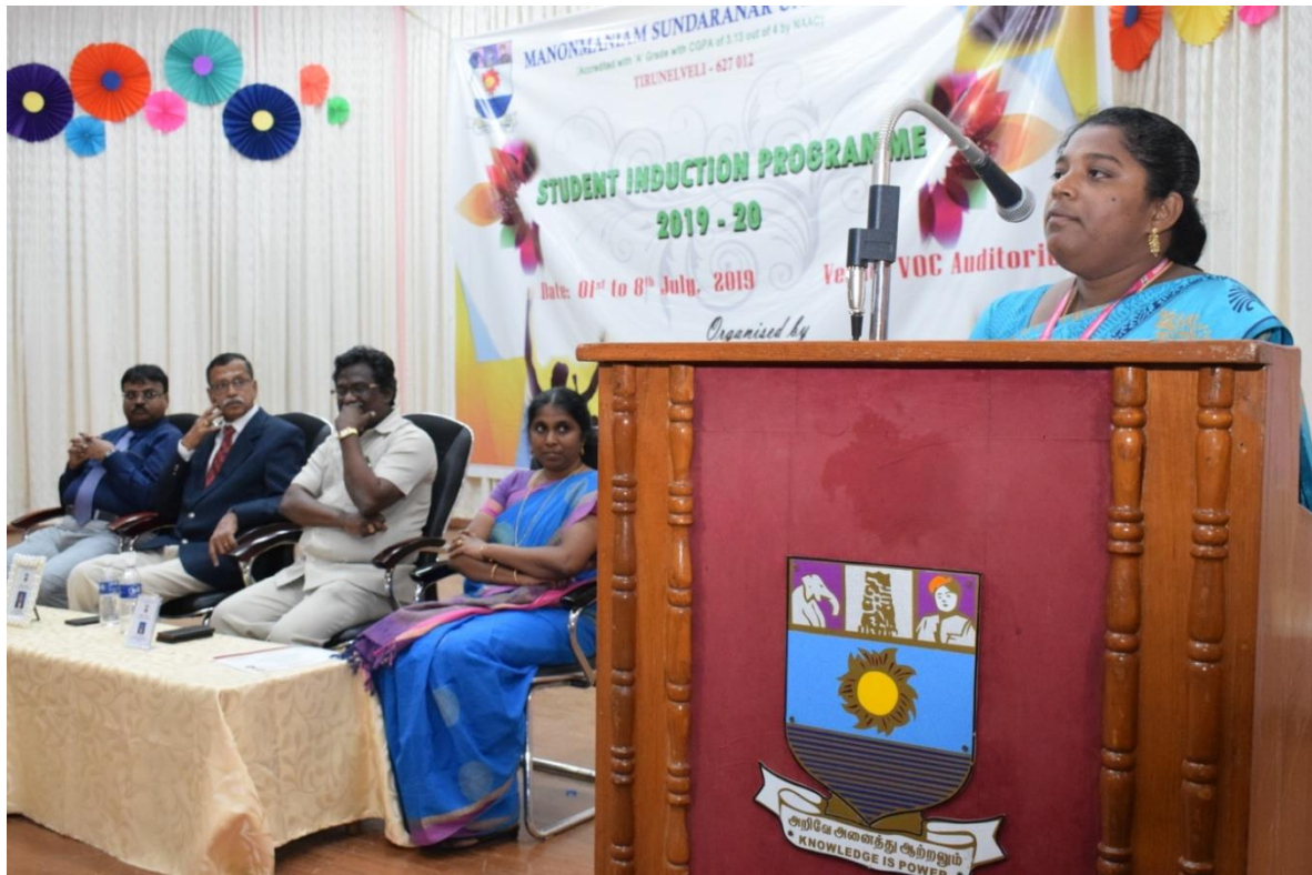
Feedback Session - Student