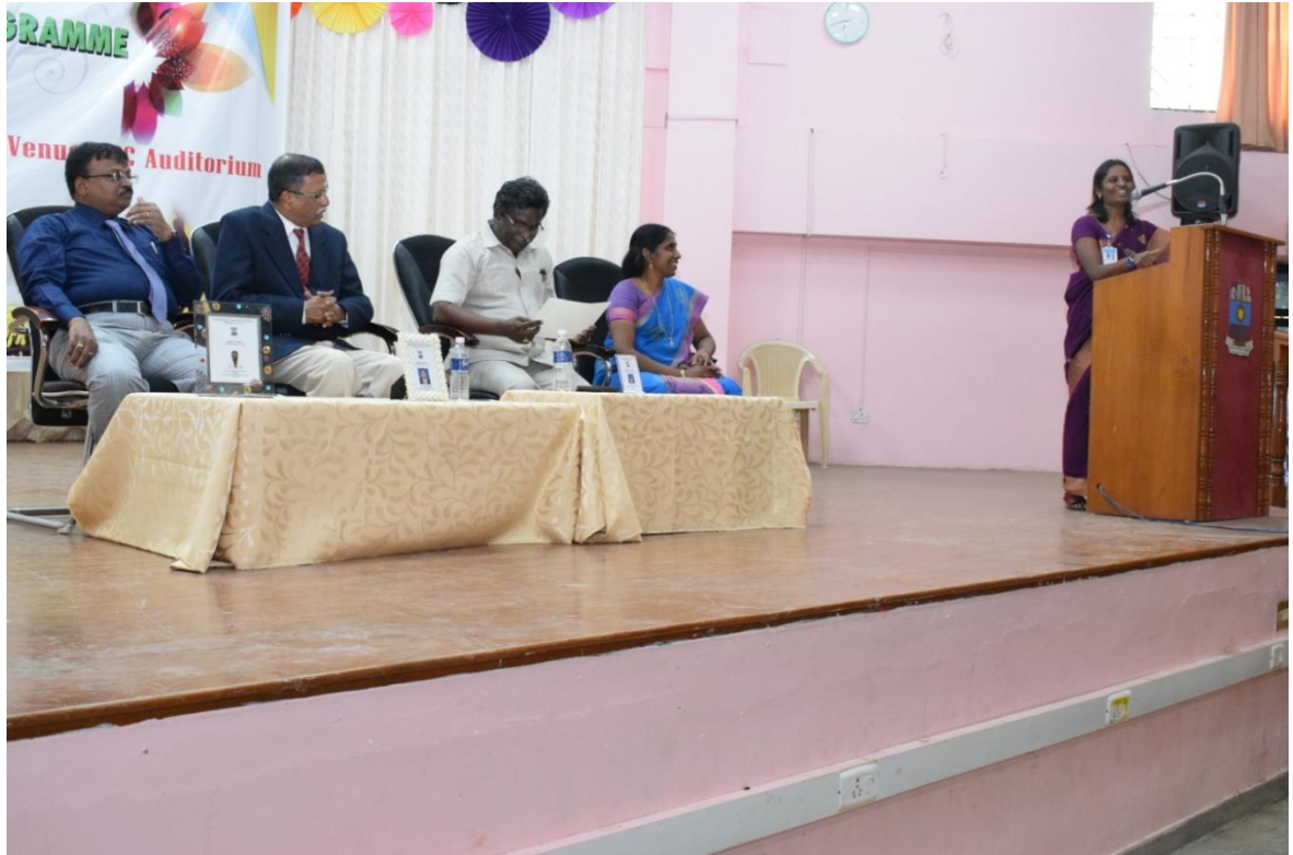
Feedback Session - Mentor