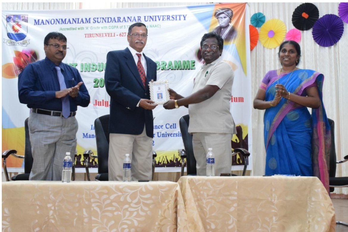
Memento to the Vice Chancellor