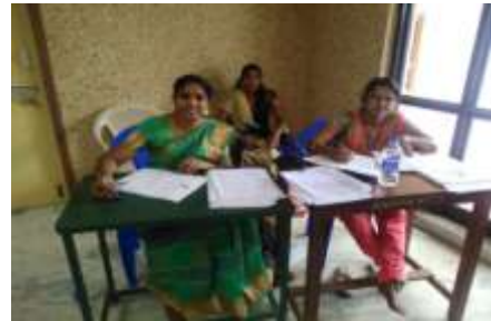
Fig. 21. The Certificate Committee