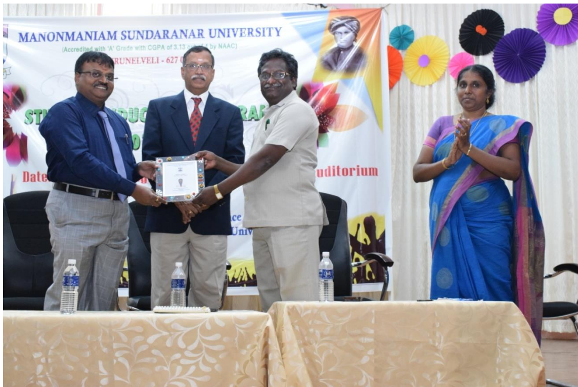
Memento to the Registrar