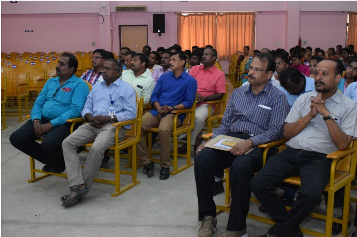
Participants – Mentors and Mentees