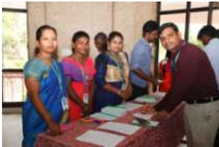
Fig. 20. The Registration Team