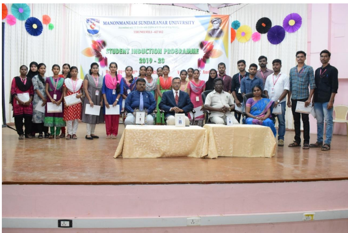
Dignitaries with MOOCs Toppers