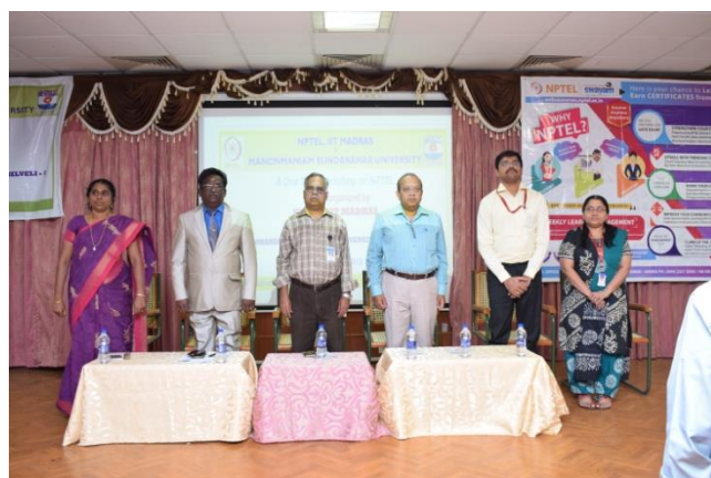
Workshop on NPTEL (Dignitaries)