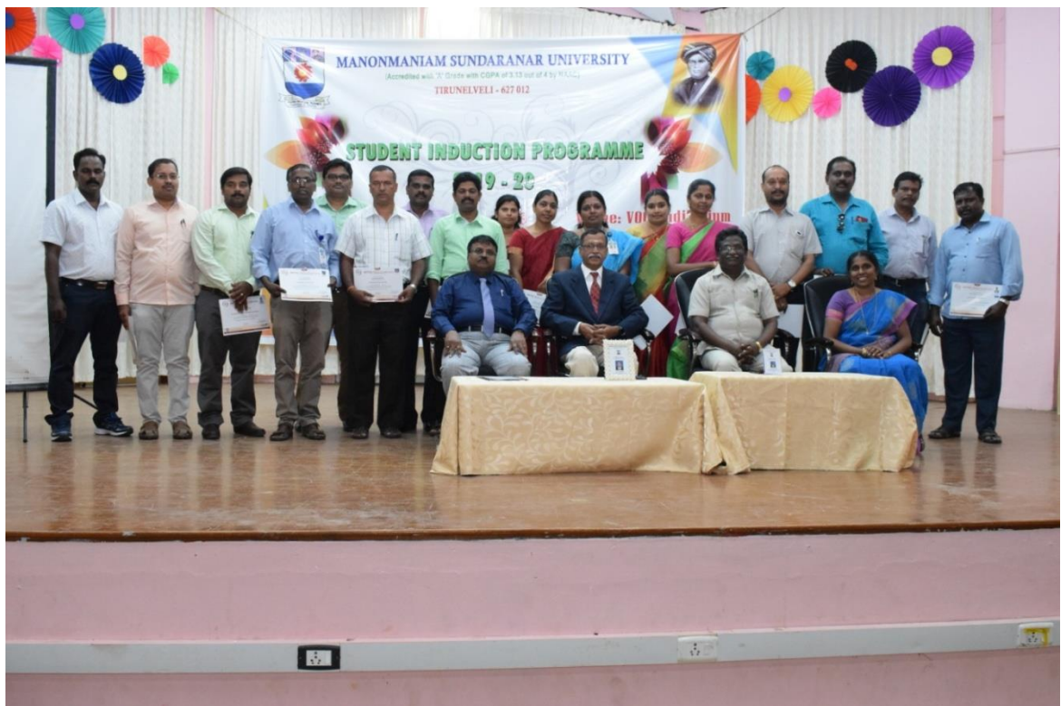
Dignitaries with Mentors