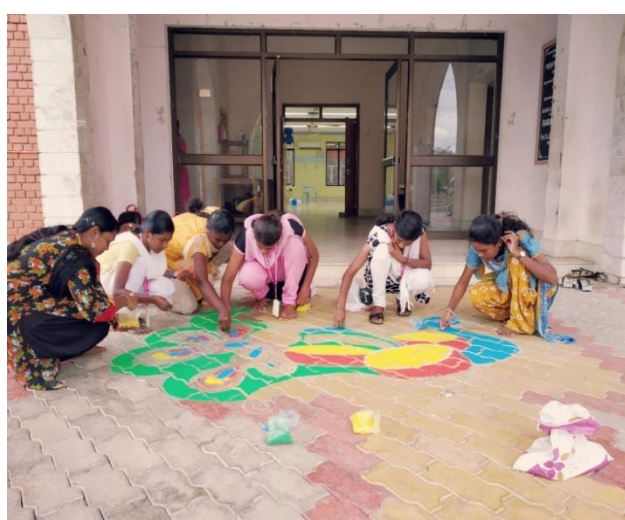
Students at work