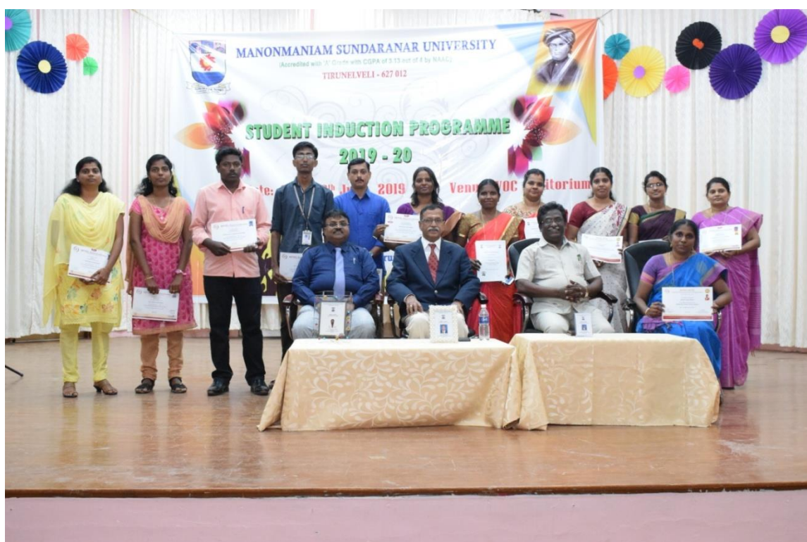
Dignitaries with Self Interested Learners