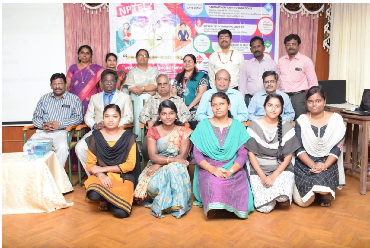
NPTEL Team and the Authorities of the University with the mini RESEARCH TEAM from the Dept. of Computer Science who played a vital role in conducting the workshop