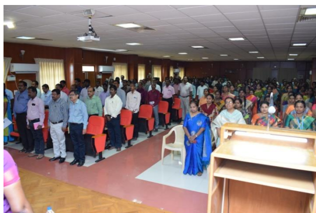
Audience (229 Participants)