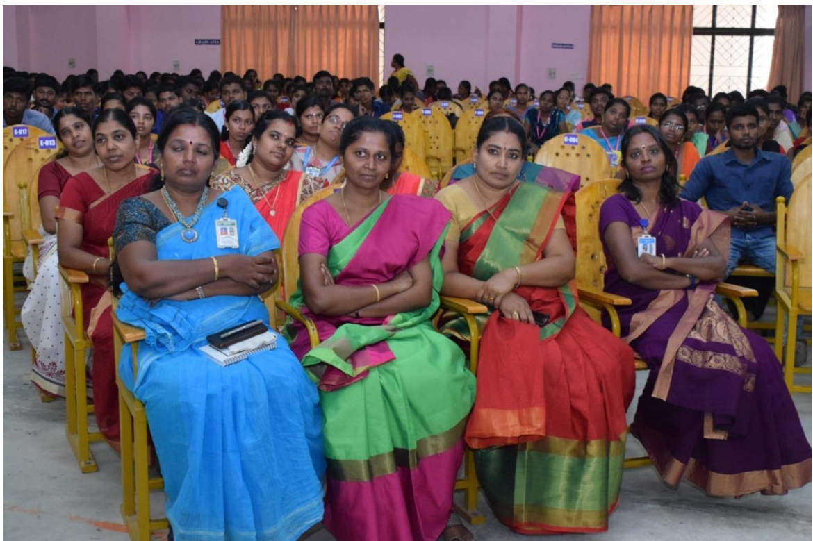
Participants – Mentors and Mentees