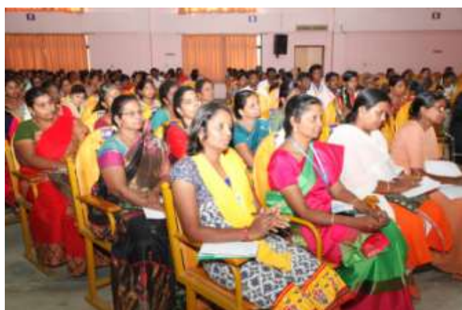
Fig. 2. The Audience